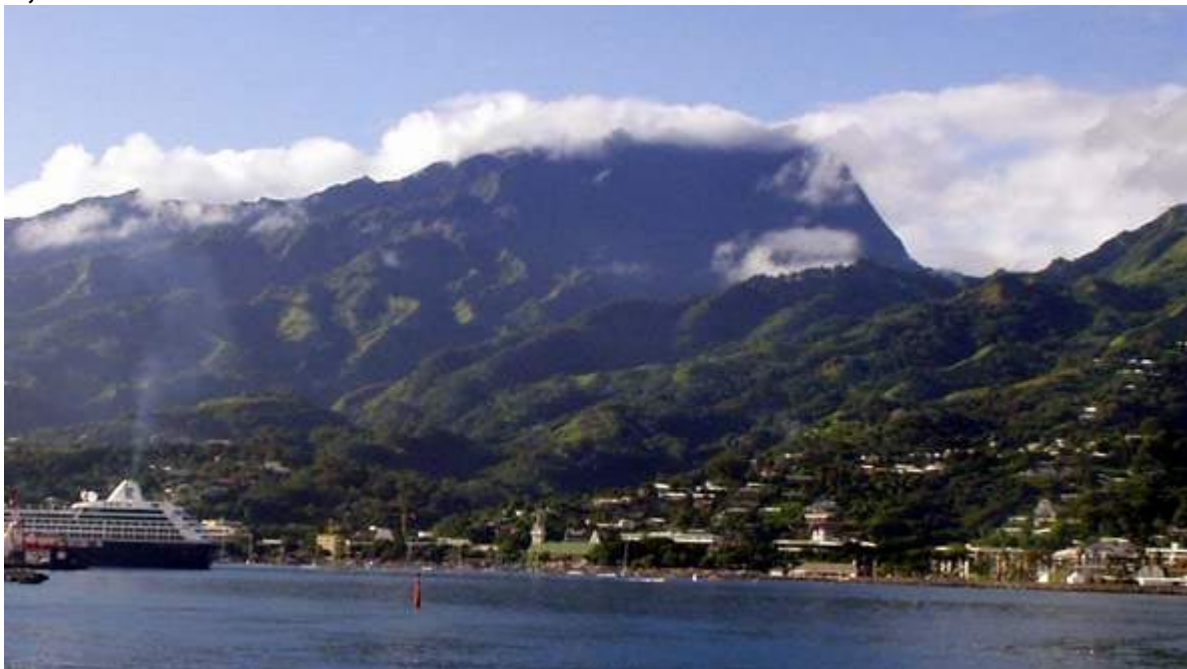
Waterfront of the bustling City of Papeete