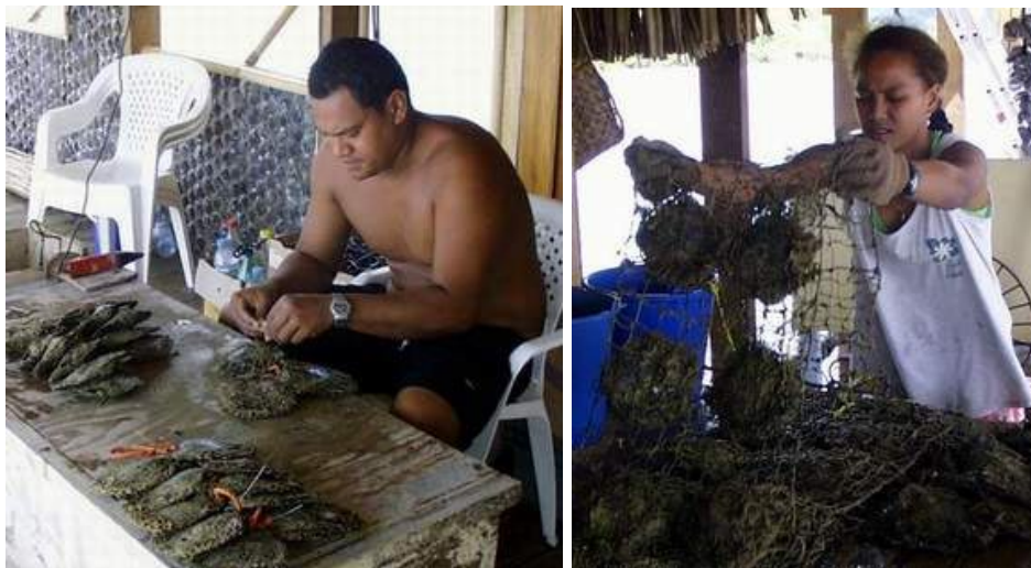
Farming black pearls.