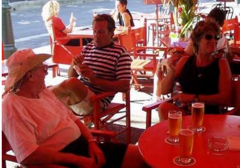
Parades make you thirsty. Relaxing at Le Retro.