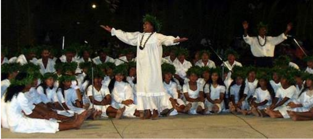
Each village also entered a large chorus for singing competition.