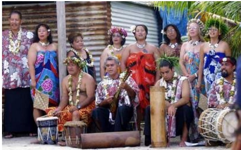
The parents of the California group provided musical accompaniment.