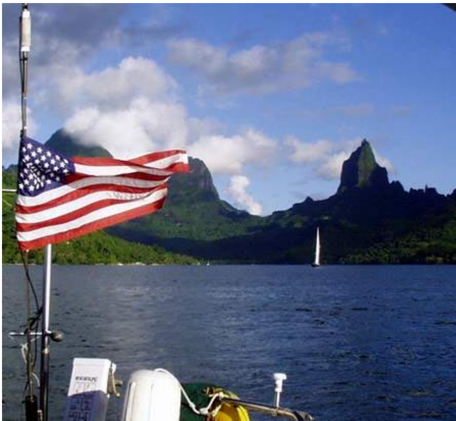
Departing Opunohu Bay, Moorea, one of Cook's anchorages.