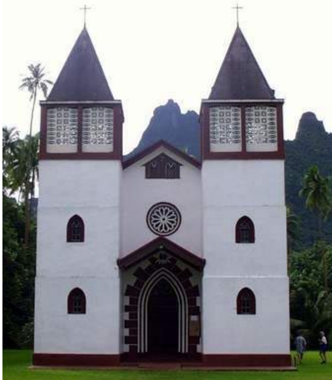
Eglise de la Sainte Famille

and virtually everything important orally. The culture was passed down through a host of oral means including story telling and dance. Now much about the old ways has been lost.