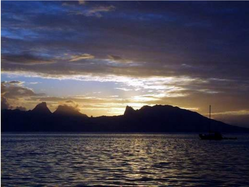
Looking over what the Tahitians call “The Sea of Moons.”