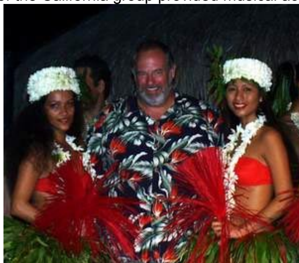
Smiling missionary attempting to convert two pagans.