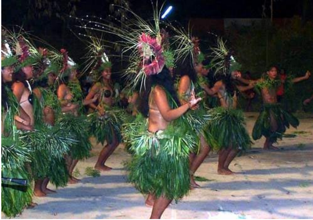
Each of the 6 villages on the island entered a dance group composed of about 50 young people.