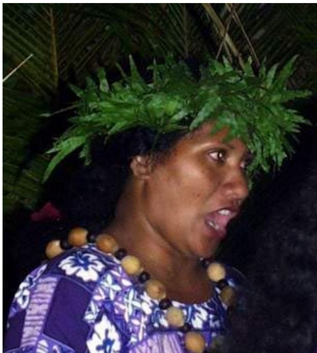
Choral backup for the dancers.