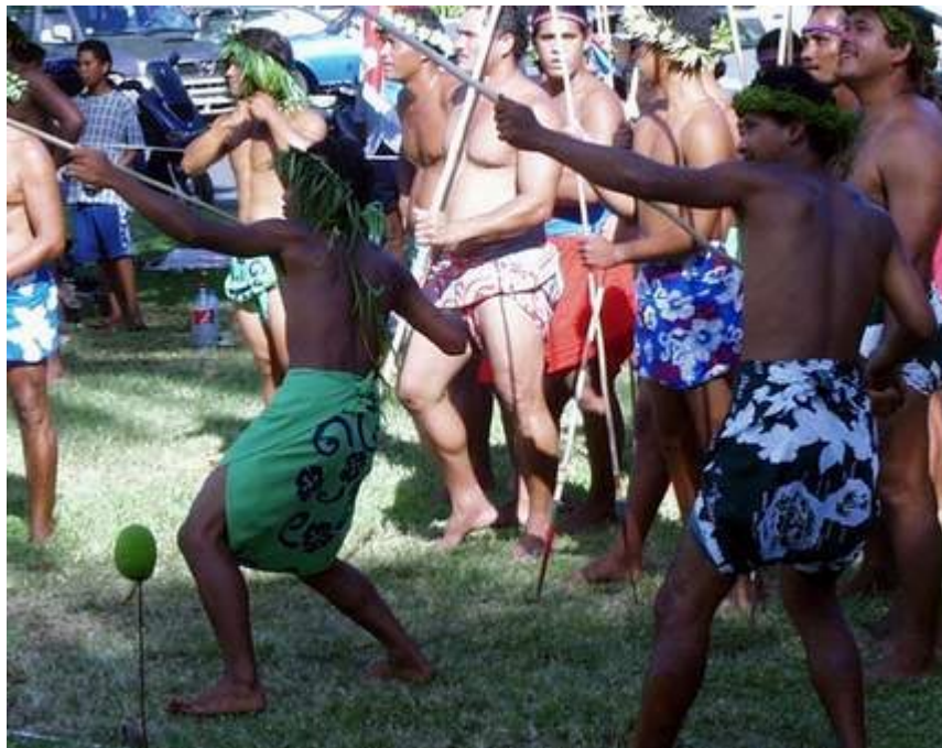
Men of diverse ages participated.