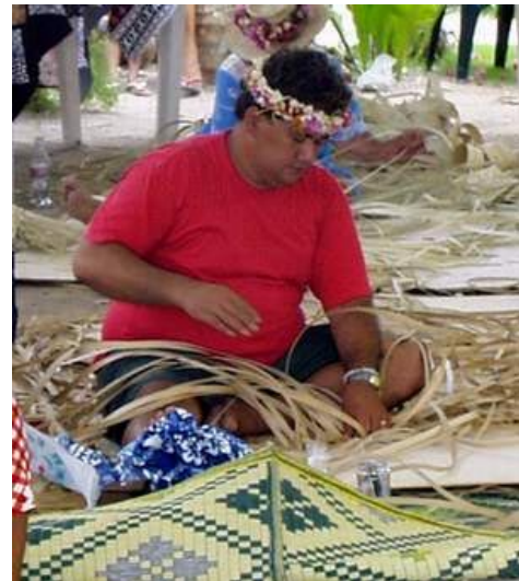
Impromptu music in municipal common area in Fare, Huahine. Weaver sings, too.