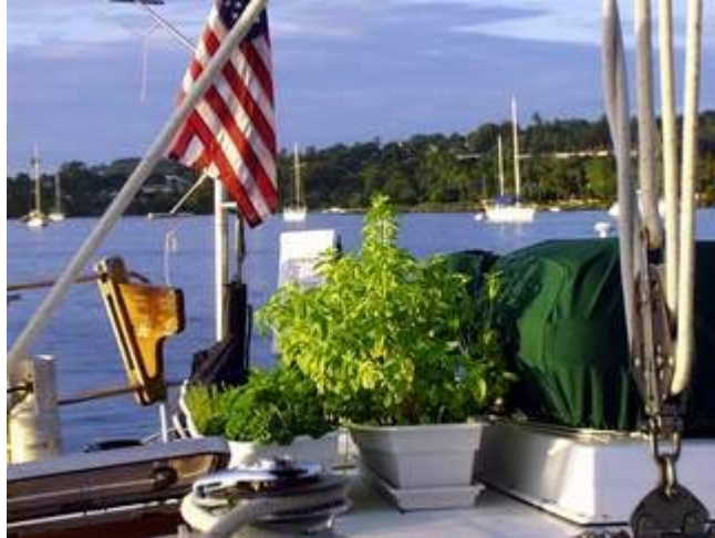
Ann's herb garden on the back of High Drama . Some people think it is "paka", the Tahitian name for grass.