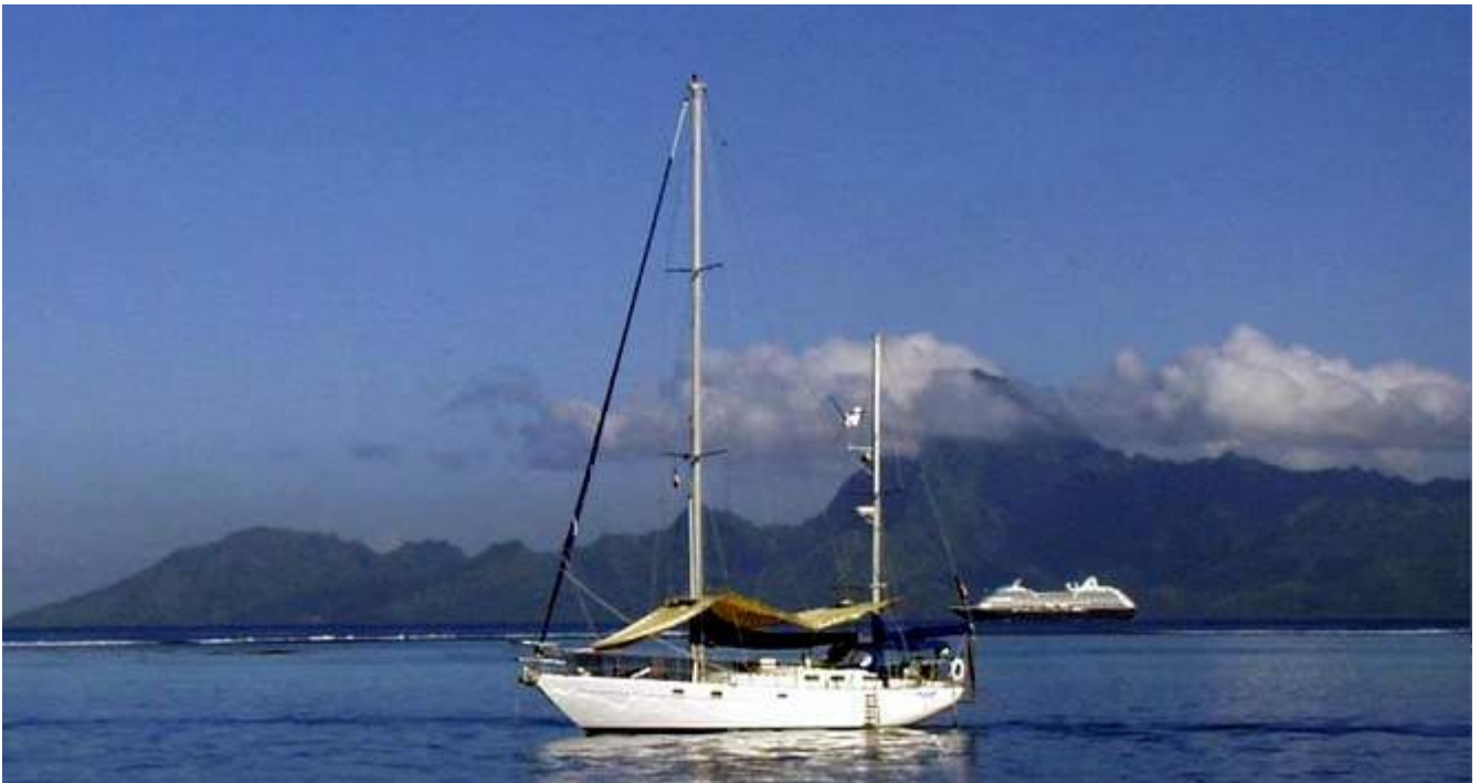
Voyager inside reef at Tahiti. Moorea in the background.