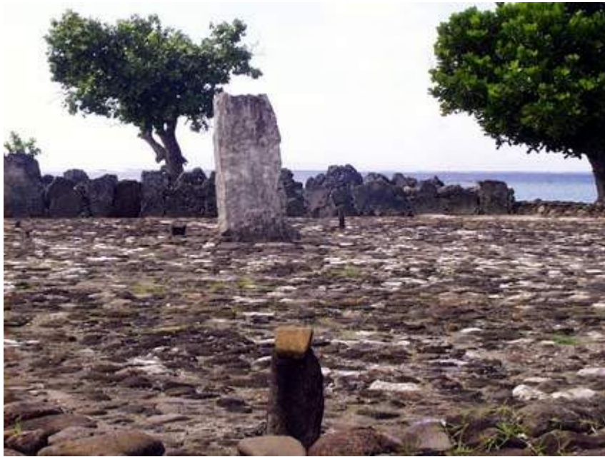
The posts next to Oro line up with the pass through the reef.

This marae in Raiatea is the most important in French Polynesia. The site, with the crude rebuilt representation of Oro, god of war and fertility, looks out the Te Ava Moa pass to the sea. Large fire pits open toward the sea. From this point on Raiatea Polynesian navigators sailed large double voyaging canoes to colonize New Zealand (2200 miles away) and Hawaii (2300 miles away). They made multiple round trips. They had no sextants, compasses, or charts. They navigated by using the stars, the ocean swells, the wind, and signs of land, such as birds, or floating plants. While Cook was a great navigator, one has to marvel at the sailing skill of the Polynesians who made these trips in frail open canoes.