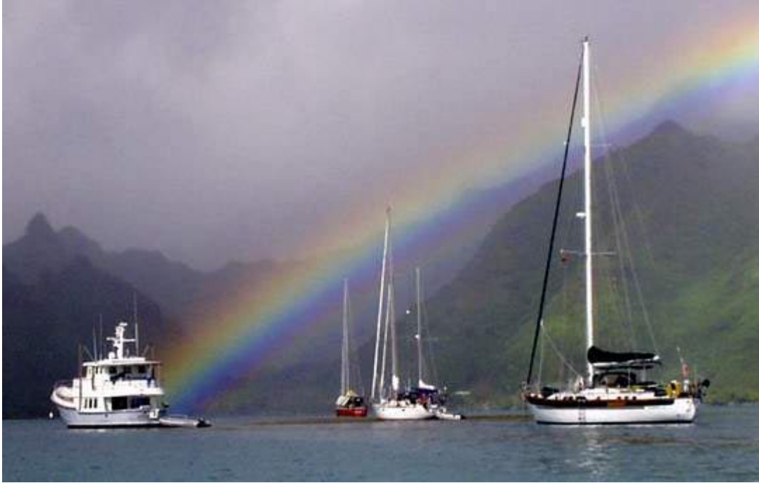
The pot of gold went to the guy who already had it in Rover , a very classy powerboat.