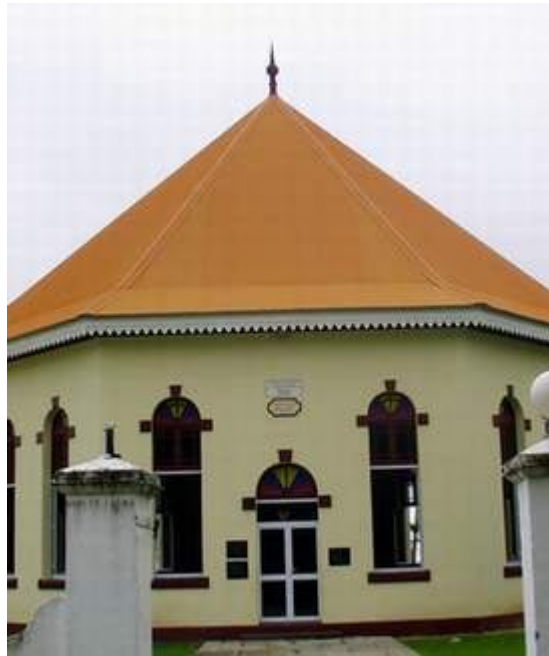
Octagonal Protestant Church Moorea

In 1792 a group from the London Missionary Society landed in Moorea and established a church where the octagonal church pictured above stands. In 1812 they converted Pomare II, the reigning leader of Tahiti, to Christianity. Shortly thereafter, Pati, the lead priest of Oro, the god of fertility and war, publicly accepted Christianity and burned all of the idols in the area. The whole population followed Pomare's example. They let the maraes where they had previously worshipped and where chiefs met to determine policy, go to seed thereafter. The islanders had no written language, but rather passed on rituals, myths, customs, taboos, navigation techniques,