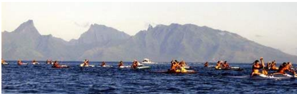
One-man canoe races.

competition, canoe races, and a fruit carrying race, arts and crafts demonstrations, a javelin-throwing contest and numerous other celebrations of Tahitian culture. The competition in Papeete includes representatives from groups from all islands in French Polynesia. However, each island has its own celebration also. In the photograph above, you see the start of the 6 man canoe races in Papeete. Views of different races follow.