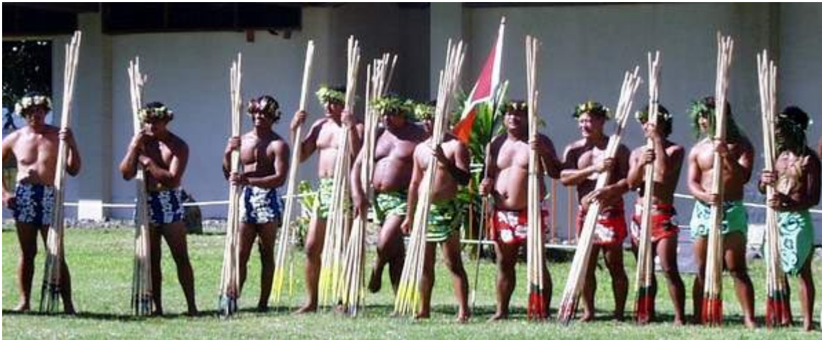
There were 4-6 throwers to a team; each man threw 10 spears in 10 minutes. There were 10 rounds.