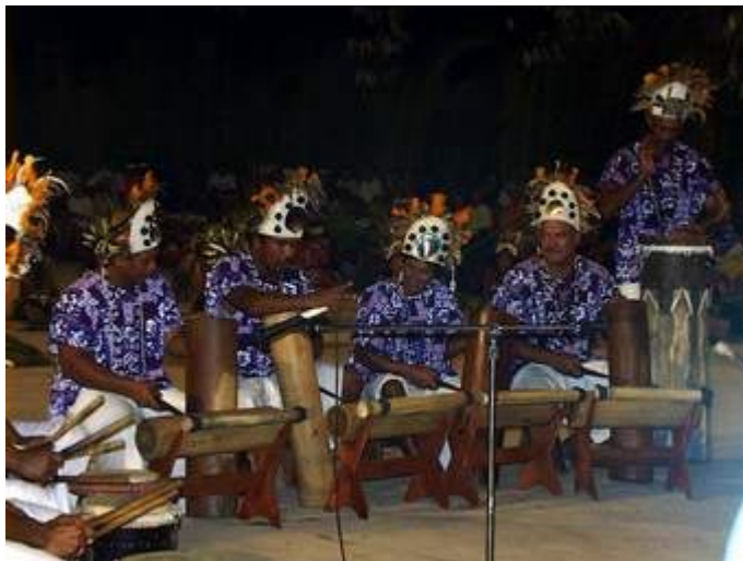
Part of the band.