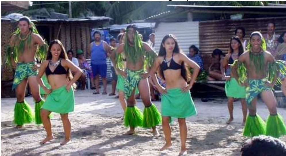
Above is the Sacramento, California Tahitian dance club performing for their Huahine hosts out in the country. Check out their website: http://tepoe.tripod.com Apparently San Jose, California has one of the biggest annual Tahitian dance competitions outside of Tahiti.