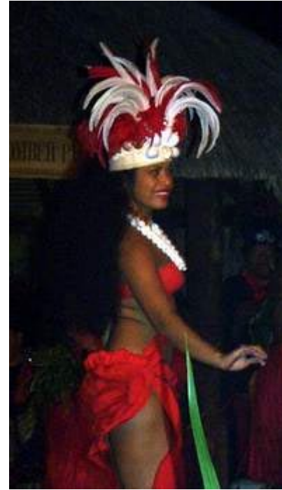
Two wonderful dancers at the Beachcomber Hotel. Below, the village competition held at Tahaa.