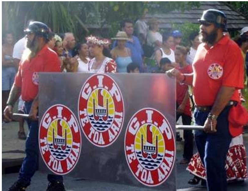
Local Union, I think.