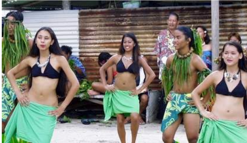
These kids spent 10 days learning from their Tahitian host families.