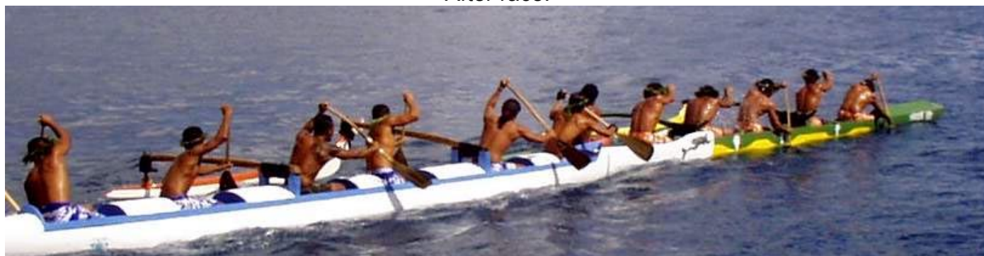
Right of way challenge.