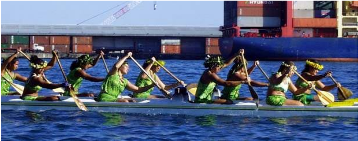
12 women per canoe.