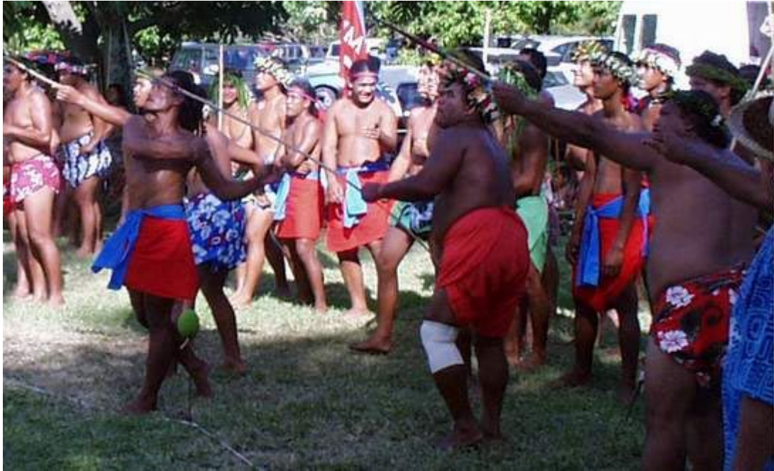
The technique required an underhand throw.