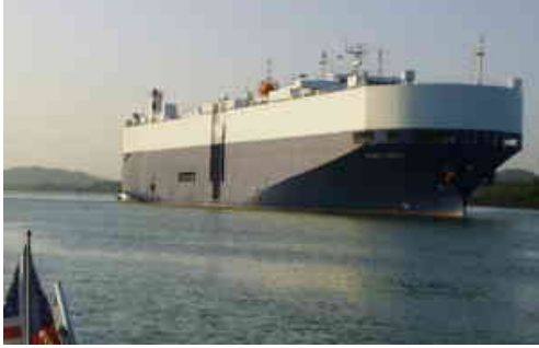
A fellow traveler