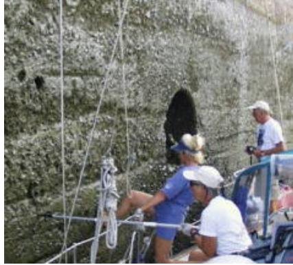
Pushing off wall