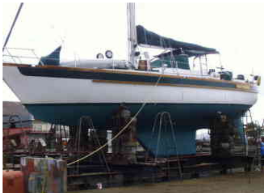
High Drama on the hard at Vaccamonte.

did not make contact with the electric motor, nor splash sea water on it. The list of “do overs” is long. Plus, there were some upgrades that we wanted. We replaced our plumbing and installed new wind instruments and a depth sounder. We even put in an electronic fishfinder with the hopes that it will give us a better picture of the bottom as we approach reefs in the South Pacific.