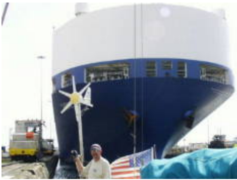
Car ship in lock behind us