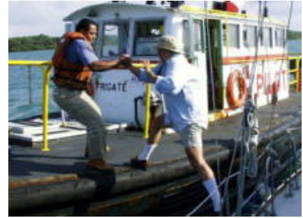
Pilot "advisor" leaving