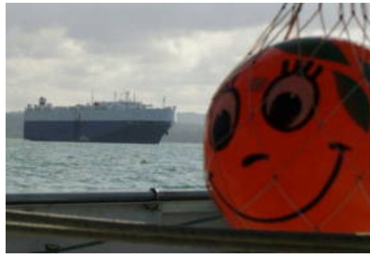
Carship in rear view mirror