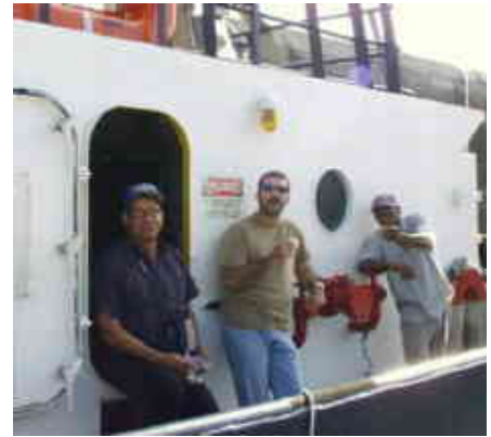
Cookies for tug crew