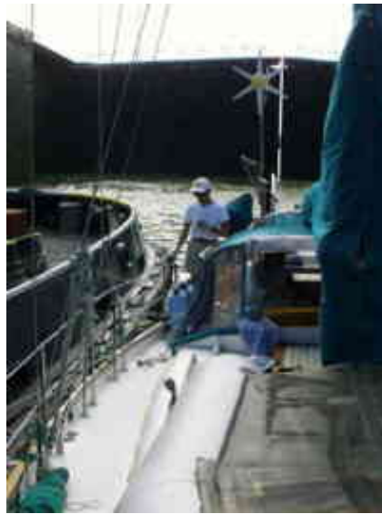
Tied to tug in lock