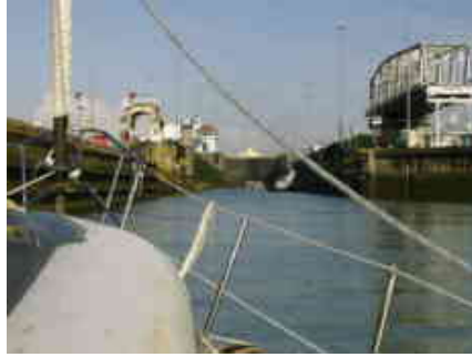
In first lock.