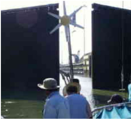
Lock doors open